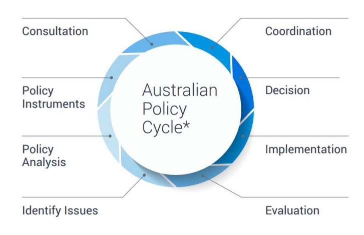
Figure 1: Policy cycle.

Where might a GEF project link into a policy cycle? The classic text on policy cycles of Bridgeman & Davis (1988), now Althaus et al. (2017), describes a widely taught, ideal eight-stage cycle (see Figure 1). The stages include: issue identification, policy analysis, policy instrument development, consultation (which permeates the entire process), coordination, decision, implementation and evaluation. Of course, this is idealised and appears to ignore the realities of messy and contested political landscapes and the reality that policy usually proceeds by a complex suite