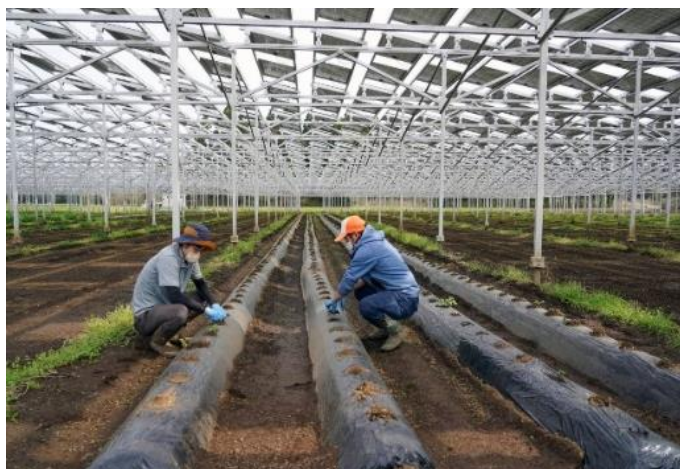
AV systems at Chiba Ecological Energy in Japan.

Japan boasts more than 3,000 small-scale agrivoltaics (AV) systems generating up to 600,000 megawatt hours of power annually, each occupying less than 0.1 hectare. A significant driver of adoption is the need for efficient land use due to limited arable land. In addition, government policies, such as subsidies and incentives to farmers, crop performance benefits, and opportunities for additional revenues, have encouraged widespread adoption. Regulations on land conversion have been clarified and provide an advantage to AV over conventional ground-mounted solar PVs. The introduction of feed-in tariffs in 2012 also facilitated quick adoption, and a 2020 amendment to the feed-in tariff law preferentially favors AV systems over conventional PVs. AV systems are being positioned as a means of revitalizing Japanese agriculture, specifically for reclaiming degraded or abandoned farmlands. A notable barrier is the reluctance of elderly farmers to make the high investments needed, mainly because they do not have successors to take over their agricultural businesses.