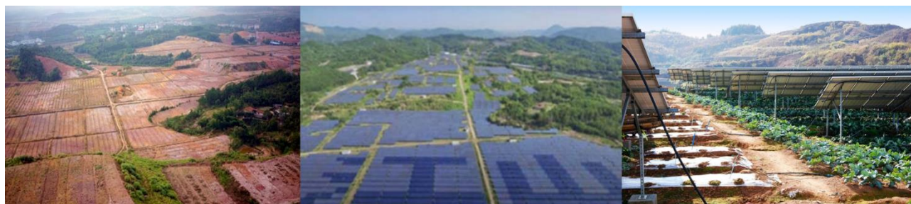
The agrivoltaics park in Jiangshan, China, before(left) and after (center, right) installation.

The systems address land degradation, agricultural profitability, and PV industry development in an integrated manner using a business model that fuses power generation, agriculture and ecotourism. It employs a multilayer PV installation (e.g. high, medium and low layers of PVs) and crop-planting approach (with shade-tolerant crops under the PV panels and non-shade-tolerant crops between the PV panels) to improve land-use efficiency while also promoting mixed cropping and associated agricultural productivity and biological diversity benefits. 40 Large areas of ornamental herbs and flowers were also planted to form colorful scenery in all seasons, providing ecotourism opportunities. The microclimate created by the shading effect of the solar panels and plants results in increased soil water storage, which ensured vegetation growth from 1% before AV system installation to 90% after, thus mitigating soil erosion and increasing soil fertility.