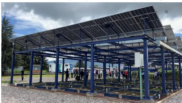
The experimental AV platform funded by the Ministry of Education, Science, Technology and Innovation of Mexico City and implemented by UNAM's Renewable Energies Institute.