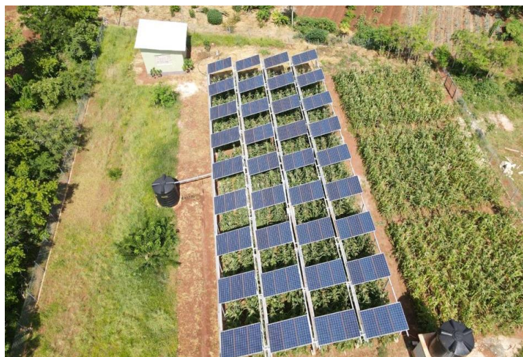
The off-grid AV system used in the Harvesting the Sun Project improved access to electricity, generated higher crop yields, and reduced irrigated water use.

Faced with significant energy security challenges, several East African countries have developed decentralized, small-scale mini-grid solar systems to tackle the problem. However, since the installing mini-grid solar systems involve land clearance, current electrification strategies lead to ecosystem degradation. Funded through the United Kingdom Research and Innovation-Global Challenges Research Fund (£1.3 million GBP), the Harvesting the Sun Twice project was designed to test the application and adaptation of AV systems in the East Africa region. The project sought to investigate the potential of AV technology to improve access to energy, increase household incomes by enabling the production of higher-value crops and identify barriers to AV adoption in the semi-arid regions of East Africa.