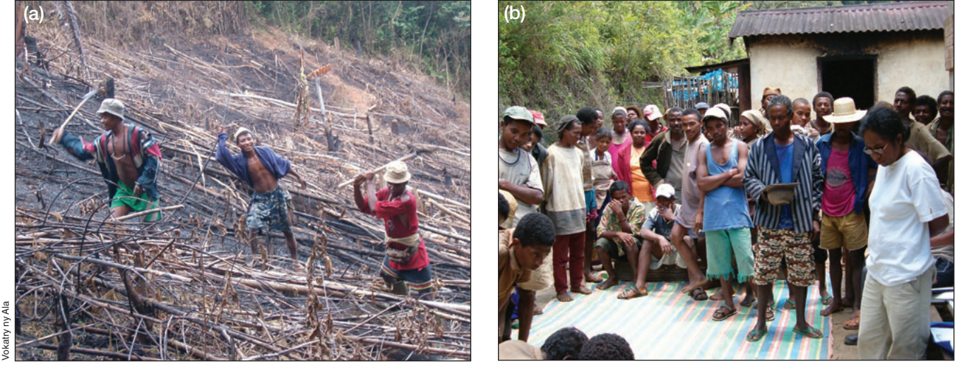
Figure 1. (a) Slash and burn agriculture is a major cause of tropical deforestation and degradation. Community forest management (CFM) can create incentives for local communities to manage their forests and limit conversion. (b) A CFM committee in Madagascar elects a new president.

Bhattacharya et al. 2010), and in some cases builds on much longer traditions of resource management by communities (Berkes 1999).