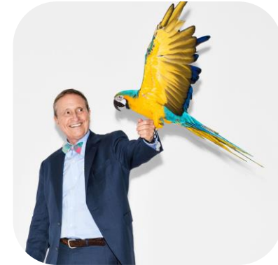
Thomas Lovejoy Senior Advisor to Chair