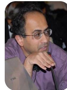
Anand Patwardhan Climate Change Adaptation India/USA