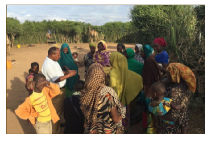
Ethiopian-GEF project team discusses environmental and livelihoods changes with stakeholders near Jijiga town, Somali Region, Ethiopia, April 2016.

The Resilience, Adaptation Pathways and Transformation Assessment (RAPTA) framework is an approach to embed resilience concepts in development projects so they can better achieve their goals, and deliver durable outcomes in the face of socio-economic uncertainty and rapid environmental change.